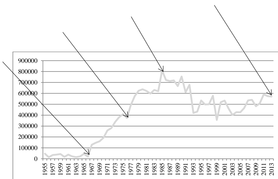
Figure 1. Movement of tourist attraction and phase of life cycle

The average relative growth rate of tourist visits on Zlatibor during the 1955 - 2013 period was about 4.38%. Over the period from 1955 to 1966 the growth rate was negative and amounted to -7.8%; the highest positive growth rate was reached over the 1967-1985 period 21.72%. After 1985, tourist attendance declined, which translated into a negative growth rate of -1.25%. Given the data on the evolution of the tourist growth rate on Zlatibor, it can be considered that Zlatibor is currently in the stage of stagnation.