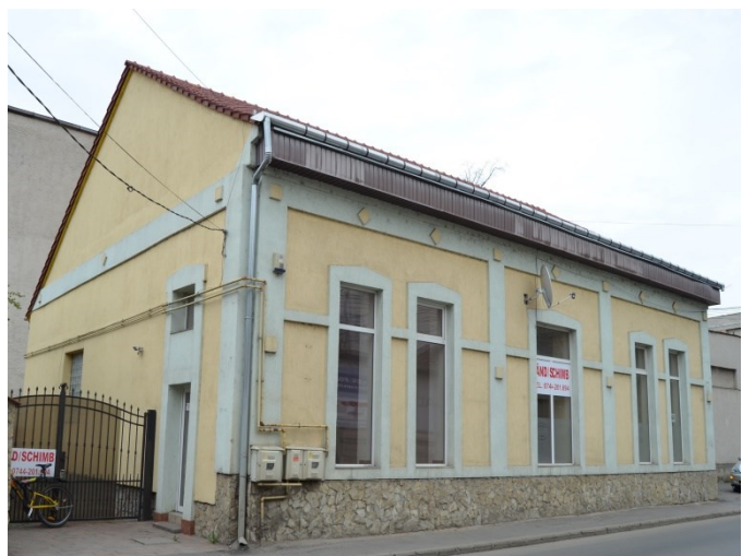
Figure 6 - House on Brancoveanu street